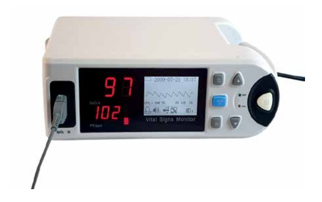
Figure 1. The pulse oximeter used in the study.

The reliability of the RSES was high: Cronbach \alpha = .81. There was no difference between the groups in two kinds of self-esteem measured before manipulation – ESE on a 10-point scale and ISE by NLE.